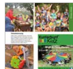
Quarter pg Ad