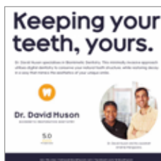
Full pg Ad