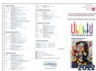
A4 Event Planner