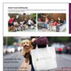
Half pg Ad